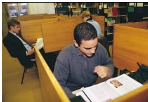
Are these results credible?

The articles in this series are excerpts from How to read a paper: the basics of evidence based medicine . The book includes chapters on searching the literature and implementing evidence based findings. It can be ordered from the BMJ Bookshop: tel 0171 383 6185/6245; fax 0171 383 6662. Price £13.95 UK members, £14.95 non-members.